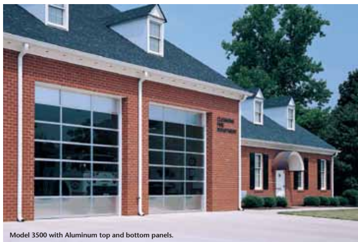
Model 3500 with Aluminum top and bottom panels.

NEW! The ClearView Aluminum Strut System provides added strength and durability to larger Model 3550 door sizes up to 24' 2", without restricting the viewing area.