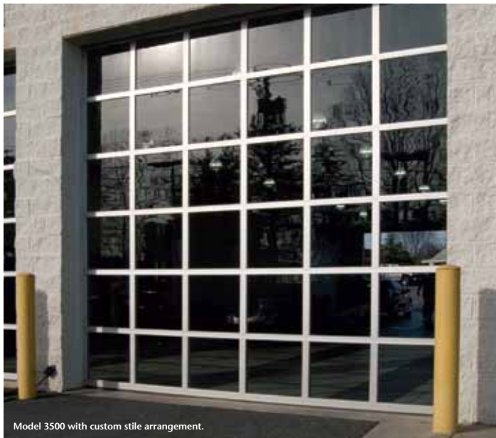
Model 3500 with custom stile arrangement.

Amarr's aluminum doors are constructed of 2" thick extruded aluminum rails and stiles and can be fitted with solid aluminum panels or a variety of full-view glass options. Perfect for automotive showrooms and repair centers, service stations, car washes, fire houses, restaurants, and sports complexes; our aluminum doors create a clean style for any facility. These doors can be mounted stationary or operative as a stylish alternative for al fresco situations.